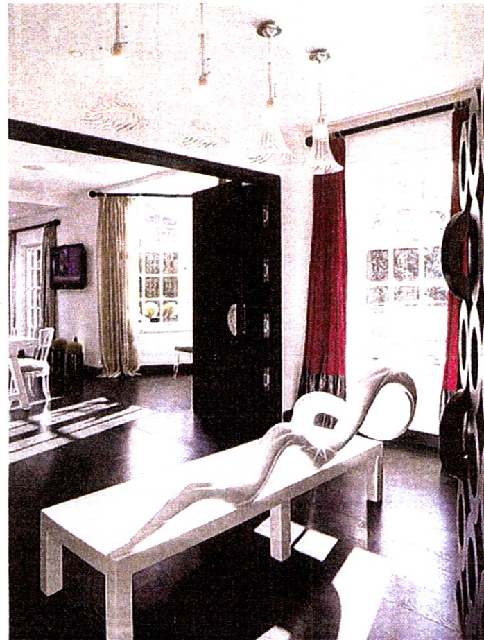
Winning formula: this new mansion in Winnington Close, above and below, has a pool and seven bedrooms

"The Suburb", as residents call it, was intended to be classless when it was founded by the philanthropist Dame Henrietta Barnett in 1904. But the area — which spans the N2 and NW11 postcodes — followed a different path into